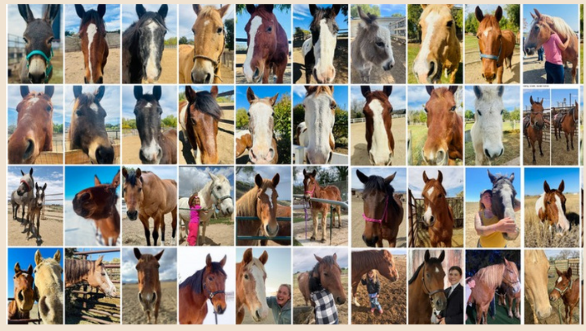
COST OF CARING FOR HORSES